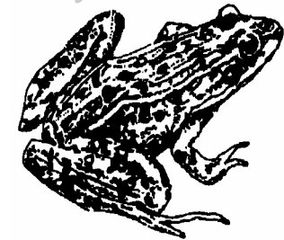
PLAINS LEOPARD FROG

Cheyenne Bottoms Wildlife Area 56 NE 40 Rd. Great Bend, KS 67530 (620) 793-7730 (24-hr. Hotline) (620) 793-3066 (Area Office) (620) 227-8609 (Regional Office)